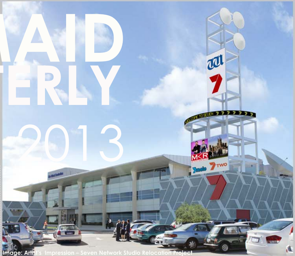
Image: Artist's Impression – Seven Network Studio Relocation Project

Ausmaid are working closely with SCA's leasing team who have secured a number of quality new tenants into their Shopping Centre Portfolio. We look forward to working with these tenants in delivering their fit-out works and transitioning to a trading environment.